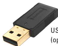
USB-Dongle FCT170 (optional)

UC Manager Download: https://www.suprag.ch/ucm