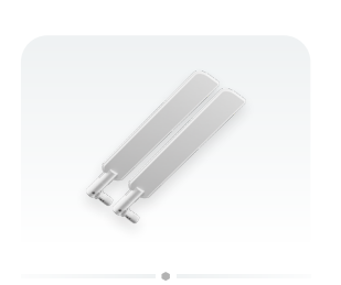
HGO-LTE-W External LTE antenna for an even stronger LTE signal. NOT INCLUDED: available for ordering separately!