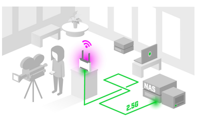
Cynthia is a video editor. She uses the 2.5 Gigabit Ethernet to reach her NAS server with all the large media files. The LTE6 modem is her main connection to the outside world – with all the messengers, online meetings, and the occasional 4K movie streams.

Compared to the regular Chateau LTE6, this version features a supercharged quad-core ARM CPU running at 1.8 GHz . It can handle even the most complex tasks without breaking a sweat. You can run complex firewall rules, provide encrypted VPN tunnels for an entire office, run the most demanding container apps right on your router, and more! The addition of 2.5 Gigabit Ethernet gives you even more options . You can use the ultrafast port to connect extra devices – like a home media server – or use it as your primary ISP connection while keeping the LTE modem for backup.