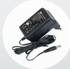
24V 0.8A Adapter